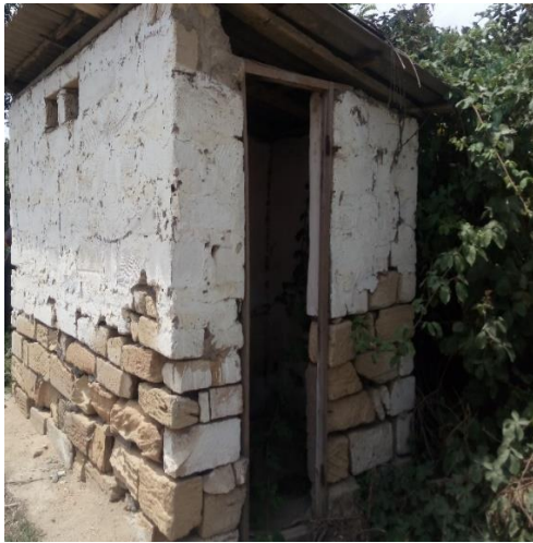
Photographs (before and after)